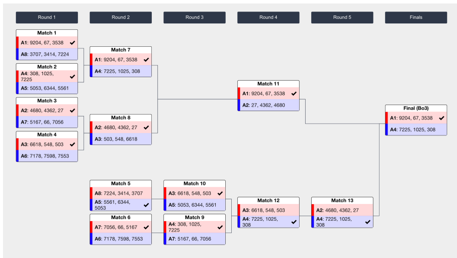
Figure 3: Playoff bracket (fills in as events complete)